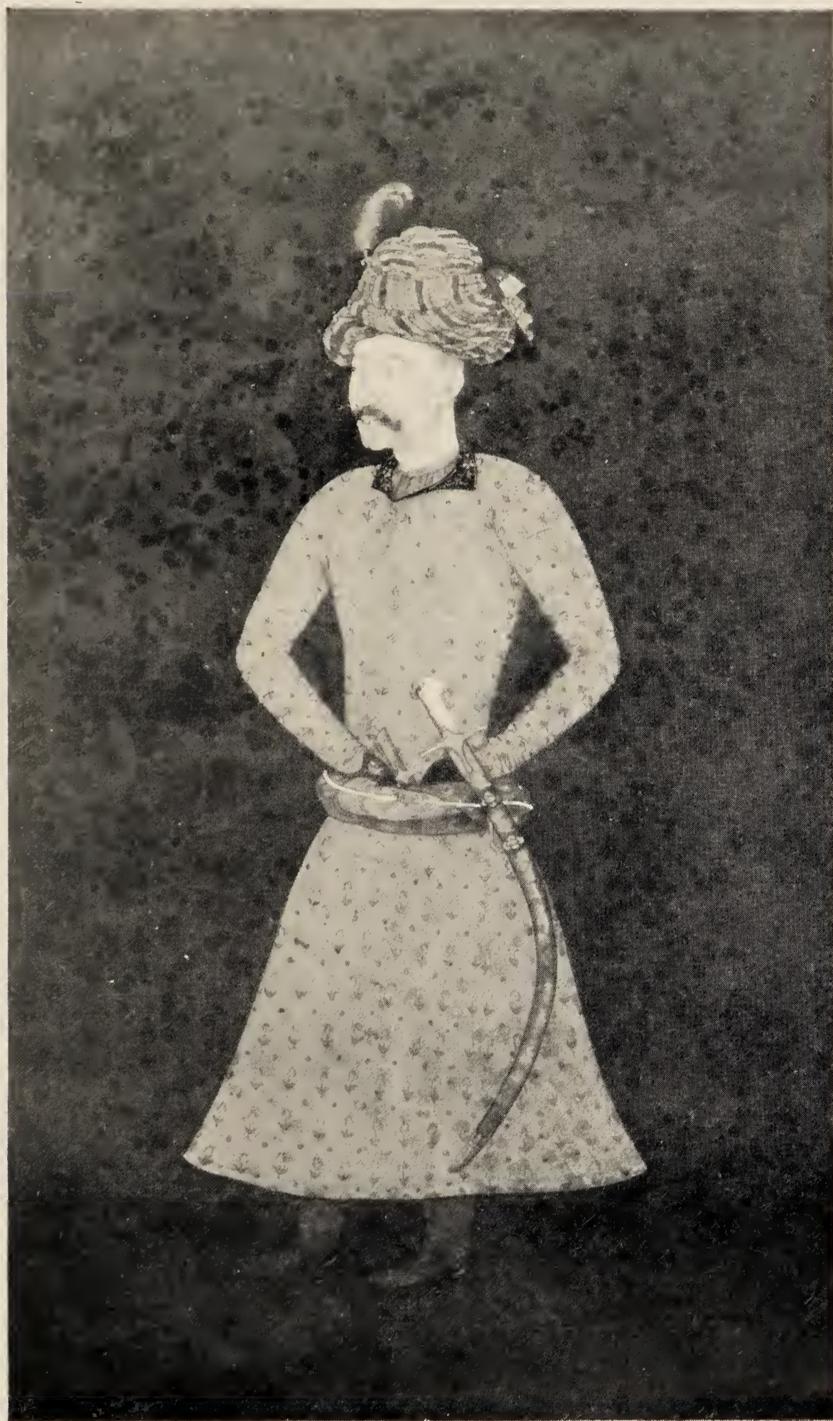
SHÁH 'ÁBBAS THE SECOND